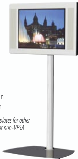
Tevella Stand Order Code TVA1000