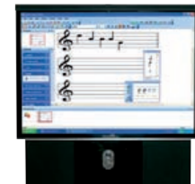
REAR PROJECTION CABINETS