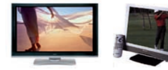
PLASMA SCREENS & HD LCD TV