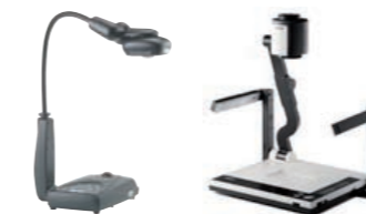
DOCUMENT CAMERAS & VISUALISERS