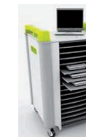
LAPTOP CHARGERS & SECURITY CABINETS