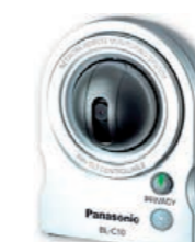
CCTV & SECURITY SYSTEMS

PHOENIX AV SOLUTIONS LTD 01939 200467 enquiries@phoenix-av.co.uk