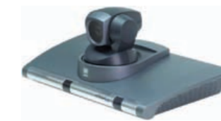
VIDEO & AUDIO CONFERENCING