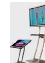
STANDS & BRACKETS