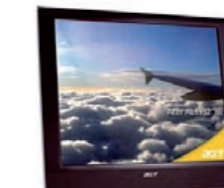
LCD MONITORS & DISPLAY SYSTEMS