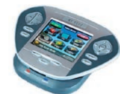
REMOTE & CONTROL SYSTEMS