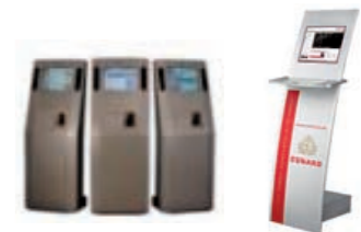
INTERACTIVE INFORMATION SYSTEMS