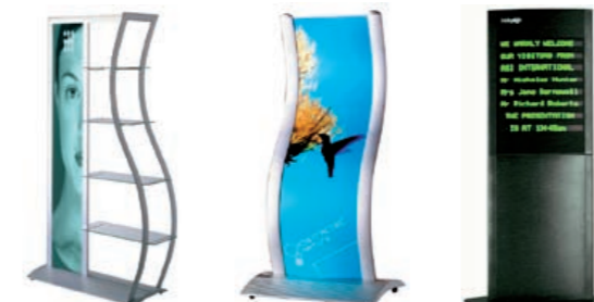
STATIC SIGNAGE & MERCHANDISING