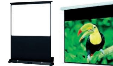
STANDARD, PULL-DOWN, PORTABLE & ELECTRIC SCREENS