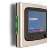
ROOM SCHEDULING & BOOKING SYSTEMS