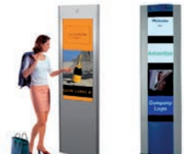
DIGITAL SIGNAGE SYSTEMS (Hardware & Software)