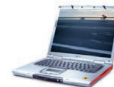
LAPTOP & TABLET PCs