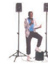
SOUND & P.A. SYSTEMS